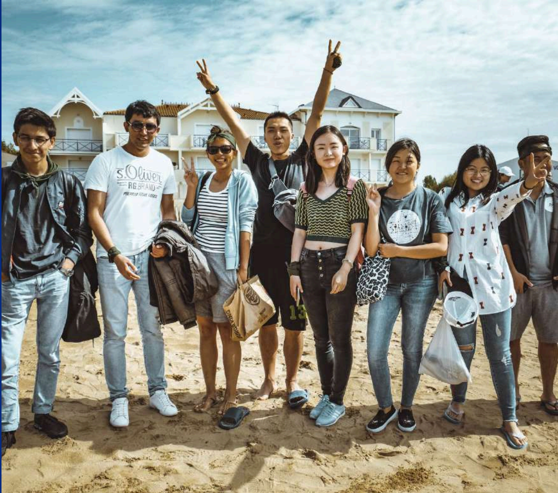
Design: Excelia All rights reserved - 03/2024 - This document is non-contractual. The Management reserves the right to modify content and dates.